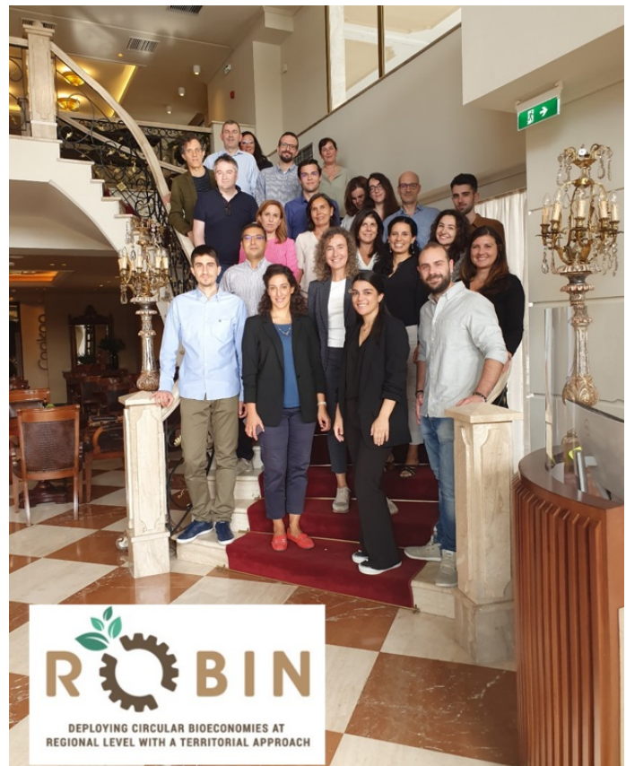
picture from the kick-off meeting of ROBIN

Baden-Württemberg has been implementing its state strategy for a sustainable bioeconomy since 2019 with dedicated resources and funding programmes. ROBIN shall contribute to the further implementation of the strategy and its update scheduled in 2024, with methodologies and tools that can be useful for its monitoring and environmental performance. ROBIN is an opportunity as well for the regional government and delegated regional development agencies to team up with European peers in the process of preparing their policy models (Southern Region in Ireland, North Macedonia in Greece and Žilina in Slovakia) or shaping the strategies they have already in place (the case of Andalusia in Spain). Other advantages of ROBIN are, for example, the further positioning of Baden-Württemberg as a beacon for other regions in Europe that have not yet implemented their bioeconomy strategies, as well as the higher visibility of its regional stakeholders at the European level.