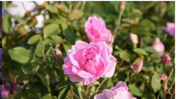
Concretes and Absolutes