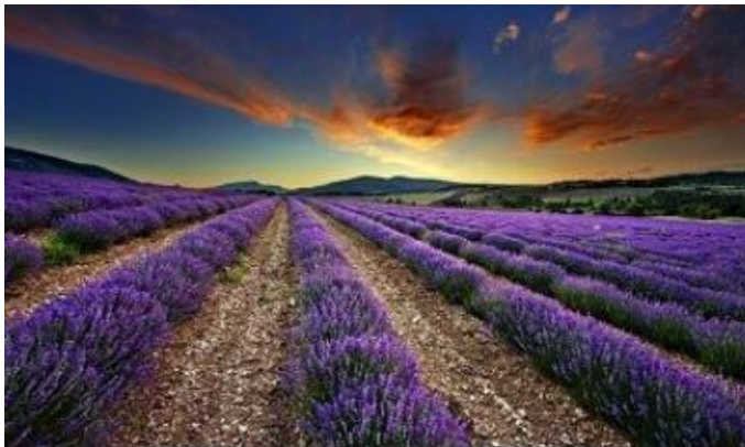
Essential Oils and Floral Waters