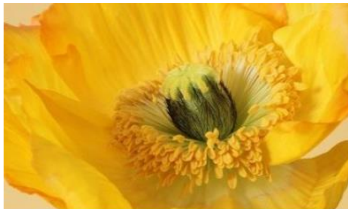
APIs (active pharmaceutical ingredients)