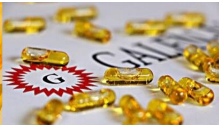
Rose Oil Capsules